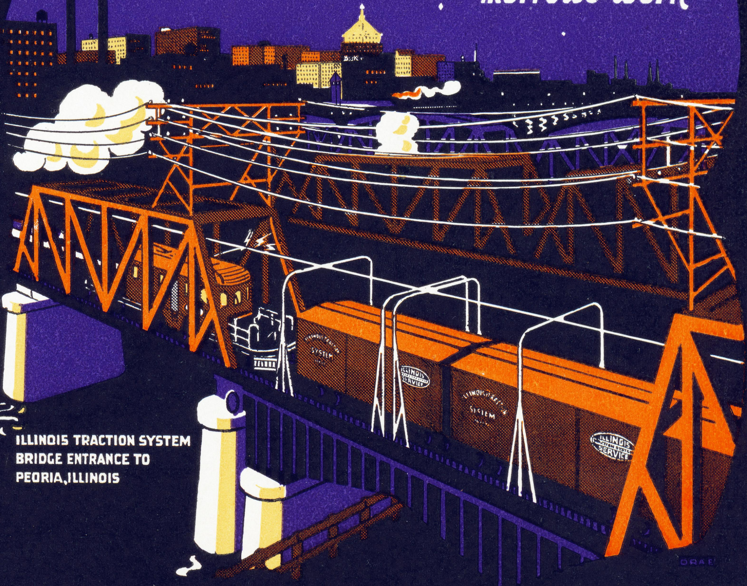
ILLINOIS TRACTION SYSTEM BRIDGE ENTRANCE TO PEORIA, ILLINOIS

these powerful electric trains are busiest—getting materials and supplies to market for the morrow's work